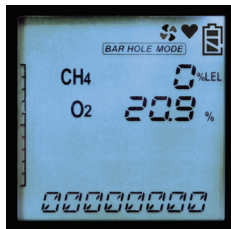
BAR HOLE MODE