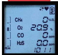
NORMAL OPERATING MODE