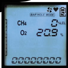
BAR HOLE MODE