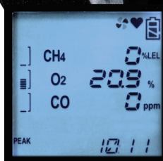
NORMAL OPERATING MODE