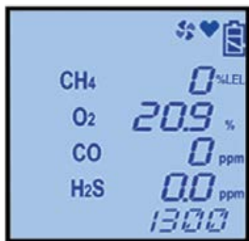
Normal Operating Mode