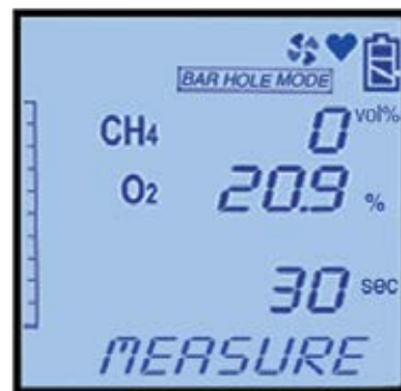
Bar Hole Mode