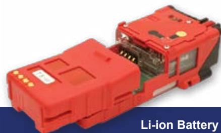
Li-ion Battery Pack