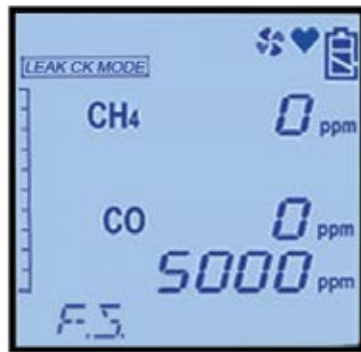
Leak Check Mode