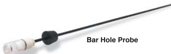
Bar Hole Probe