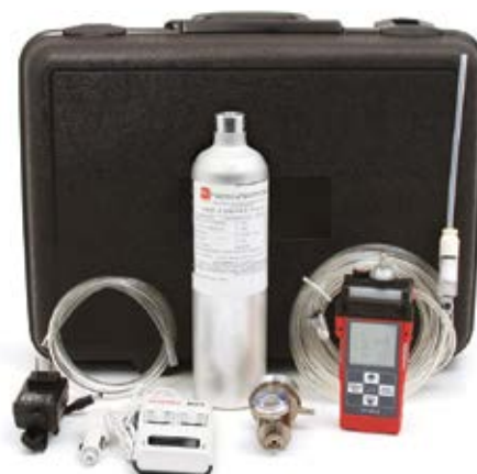
Confined Space Kit