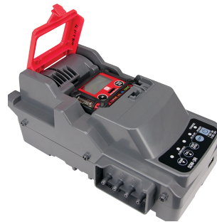
Calibration Station SDM-3R