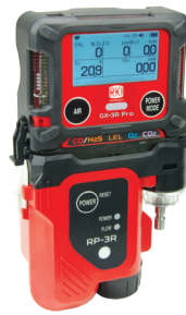
Attachable Sample Draw Pump RP-3R