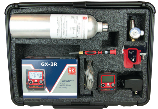
Confined Space kits