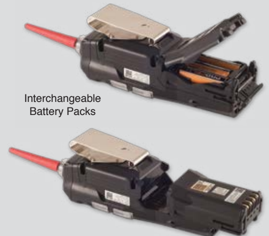
Interchangeable Battery Packs