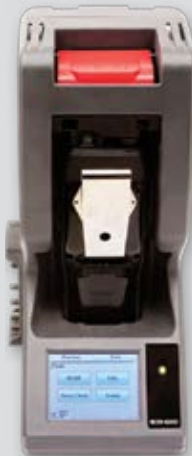
SDM-6000 Calibration Station