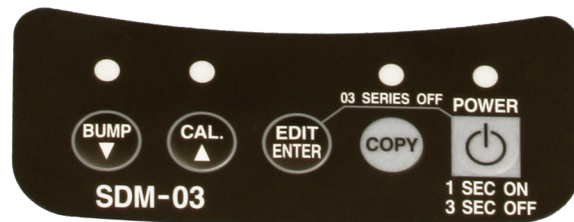
Control Panel View