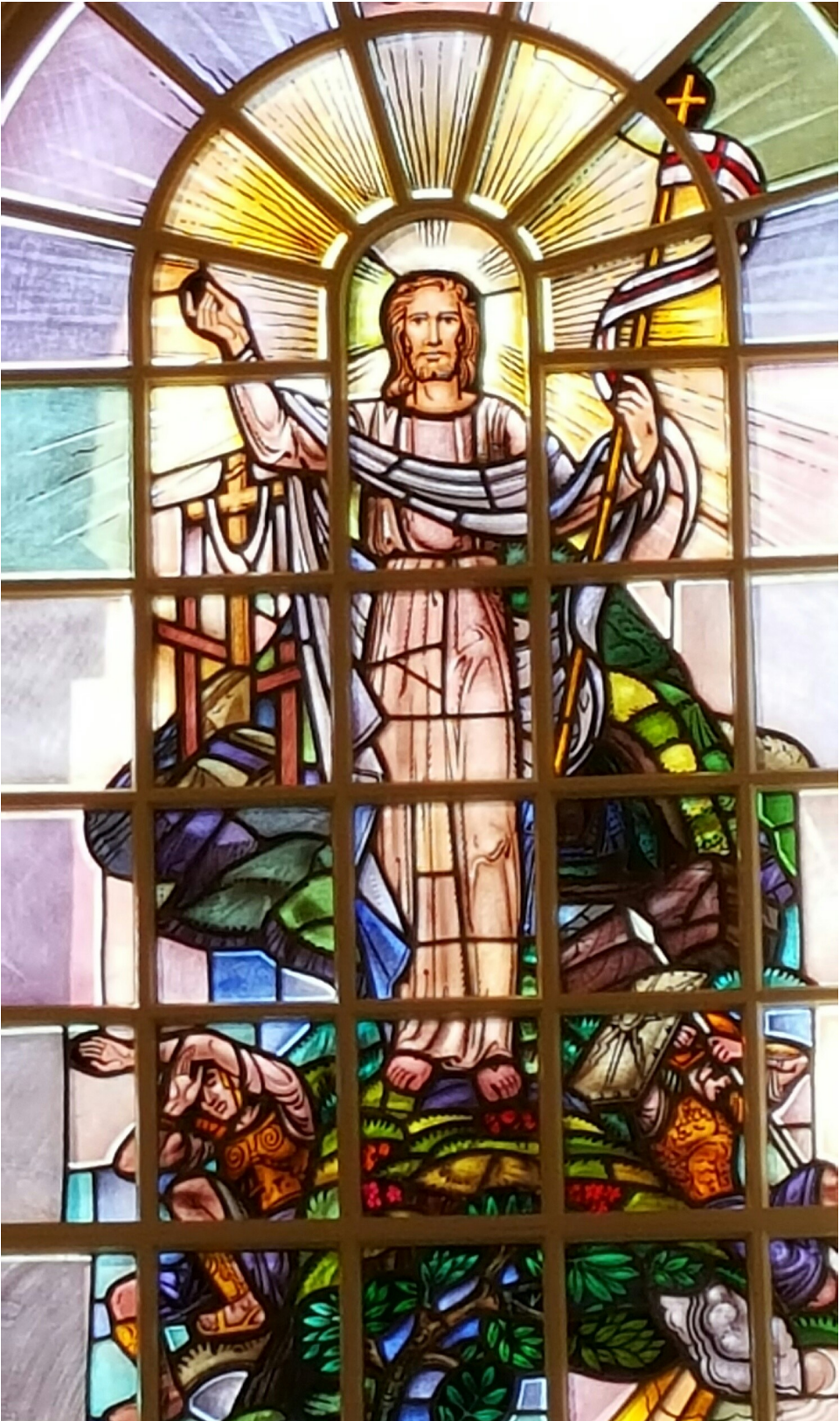
EASTER SUNDAY, APRIL 17, 2022