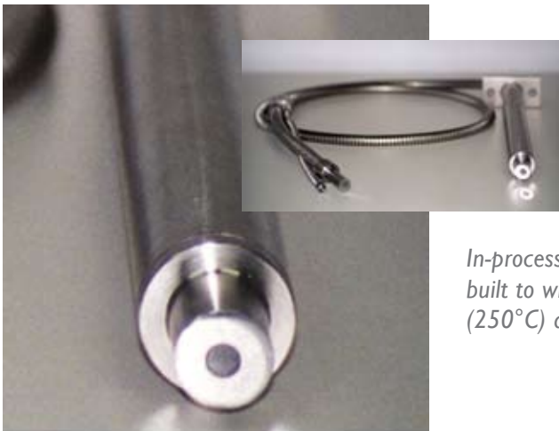
In-process reflectance probe; built to withstand high temperature environment (250°C) and abrasive substances