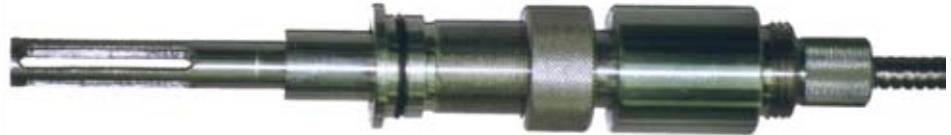
High pressure (20 bar) and temperature (150°C) reflectance probe with a sapphire window; built for operation in corrosive environments