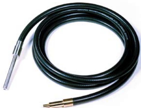
Ruggedized glass bundle for food processing application