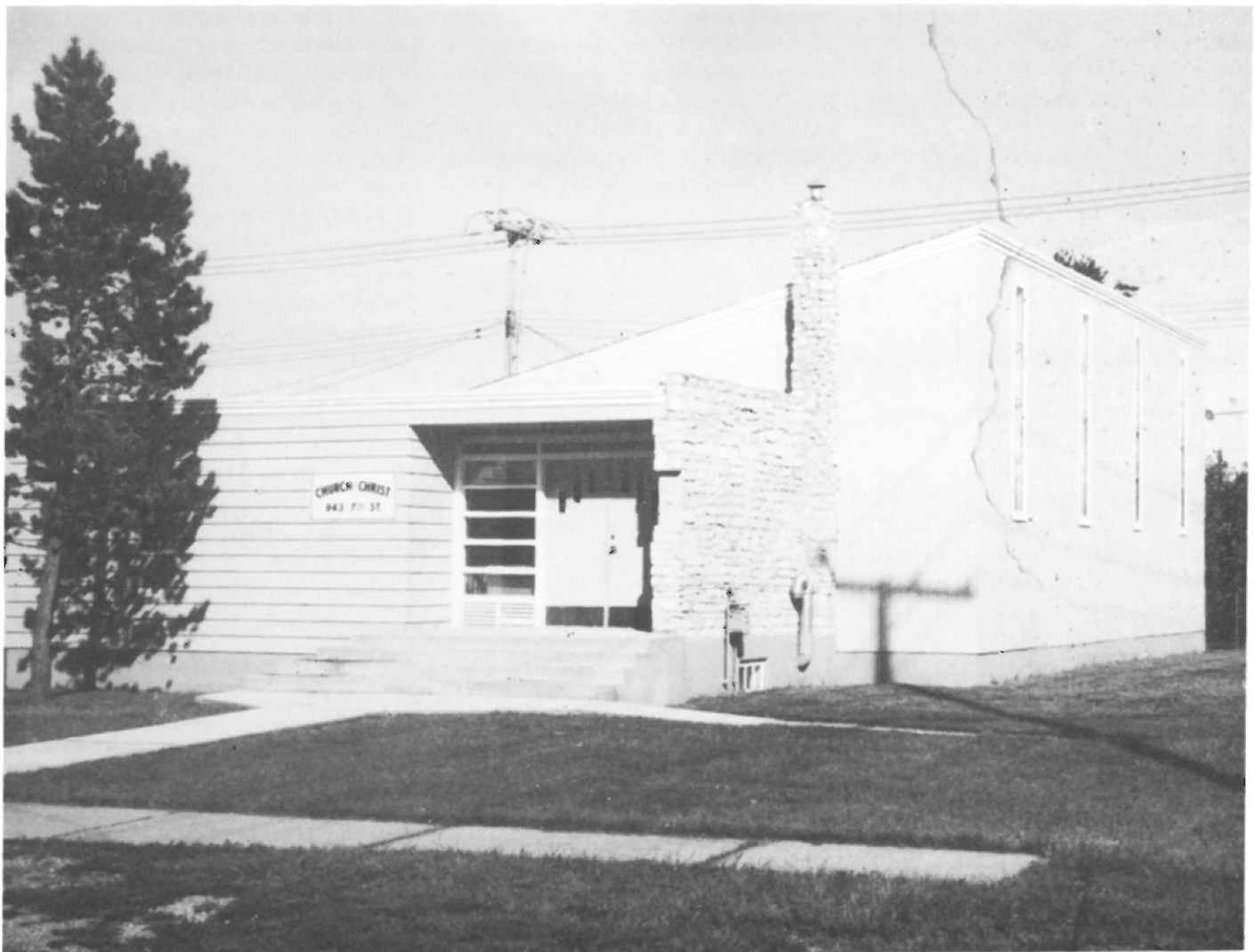
Pictured above is the meeting place of the church of Christ at 943 7th Street in Brandon, Manitoba