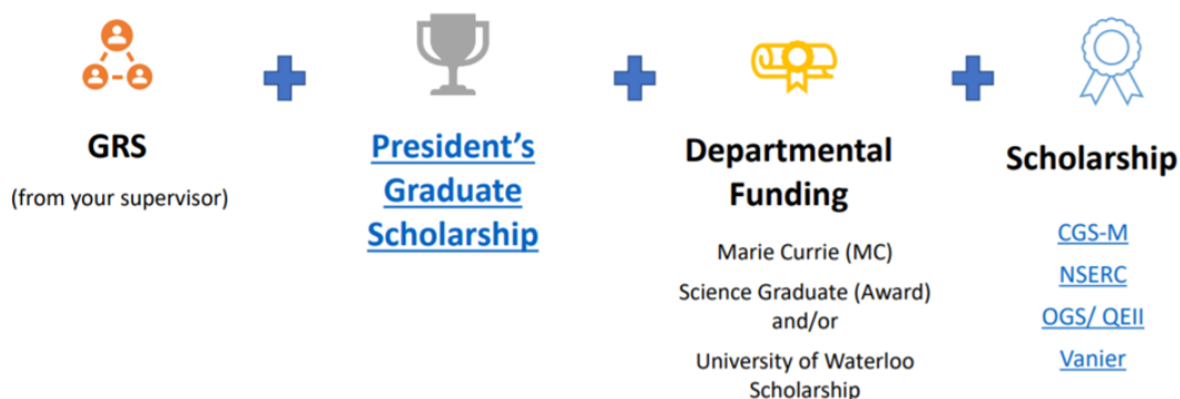
Figure 2. Example of how a faculty or department could outline a funding package based on Department of Physics and Astronomy funding packages layout.