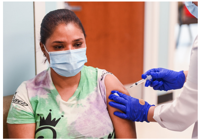
AVERAGE STRESS LEVEL OVER THE PAST MONTH RELATED TO THE CORONAVIRUS PANDEMIC

This unequal burden of stress on Hispanic adults was not surprising considering findings from the survey that shine a light on racial and ethnic disparities in relation to the impact of the pandemic. Specifically, Hispanic adults were more likely than non-Hispanic white adults to know someone who had been sick with or died of COVID-19 (sick: 64% vs. 46%; died: 42% vs. 25%).