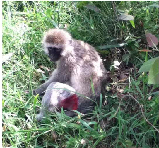
Figure 7: A vervet monkey with a temporary mark recovers from anesthesia.