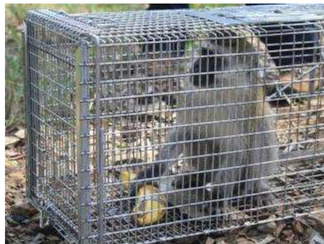
Figure 2: Vervet Monkey triggering the trap while trying to remove a banana.