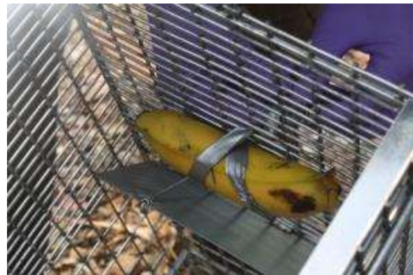
Figure 1: Tying a banana to the trap.