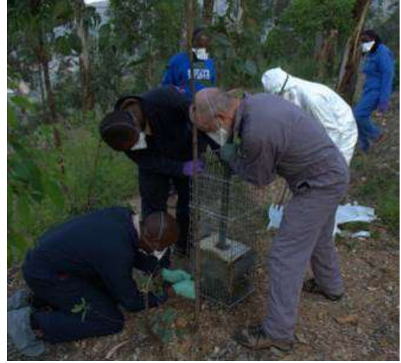
Figure 4: PREDICT team inserting the comb just under the trap door so that the door can be opened without the monkey escaping (left). Anesthetic drugs are hand-injected through the bars at the bottom of the trap where the monkey is confined by the plunger tool (right).