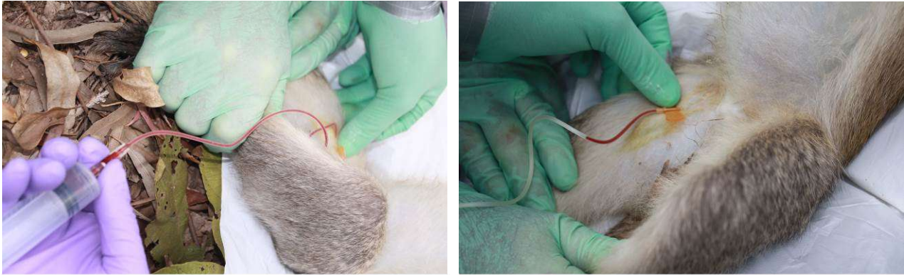
Figure 6: Blood collection from the femoral vein of a vervet monkey. the handler.