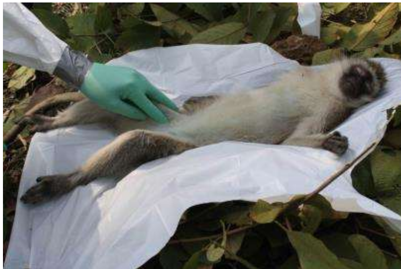
Figure 3: An anesthetized vervet monkey at the processing station with a PREDICT field team member identifying the femoral vein.