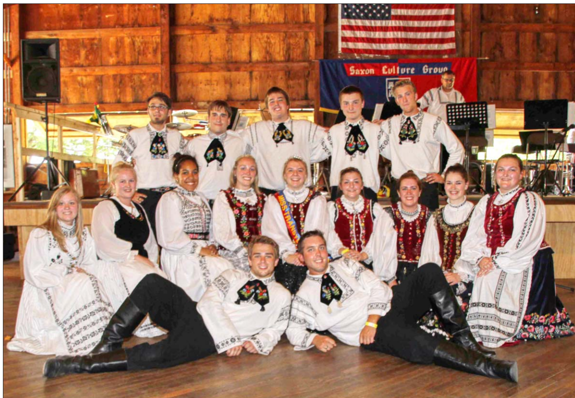
TCK Youth Dance Group at Heimattag in Salem, Ohio

Our Office Hours: Wednesday to Friday – 0900 to 1300