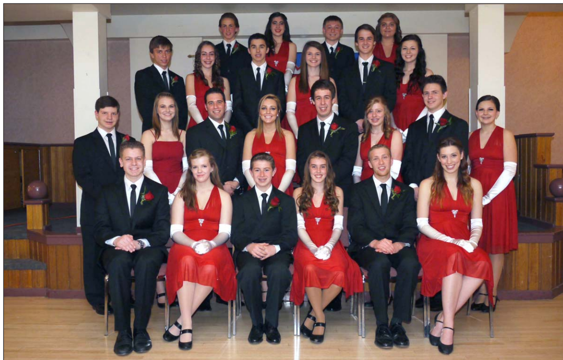
Ballroom Dance Graduates - 2013

Our Office Hours: Wednesday to Friday – 0900 to 1300