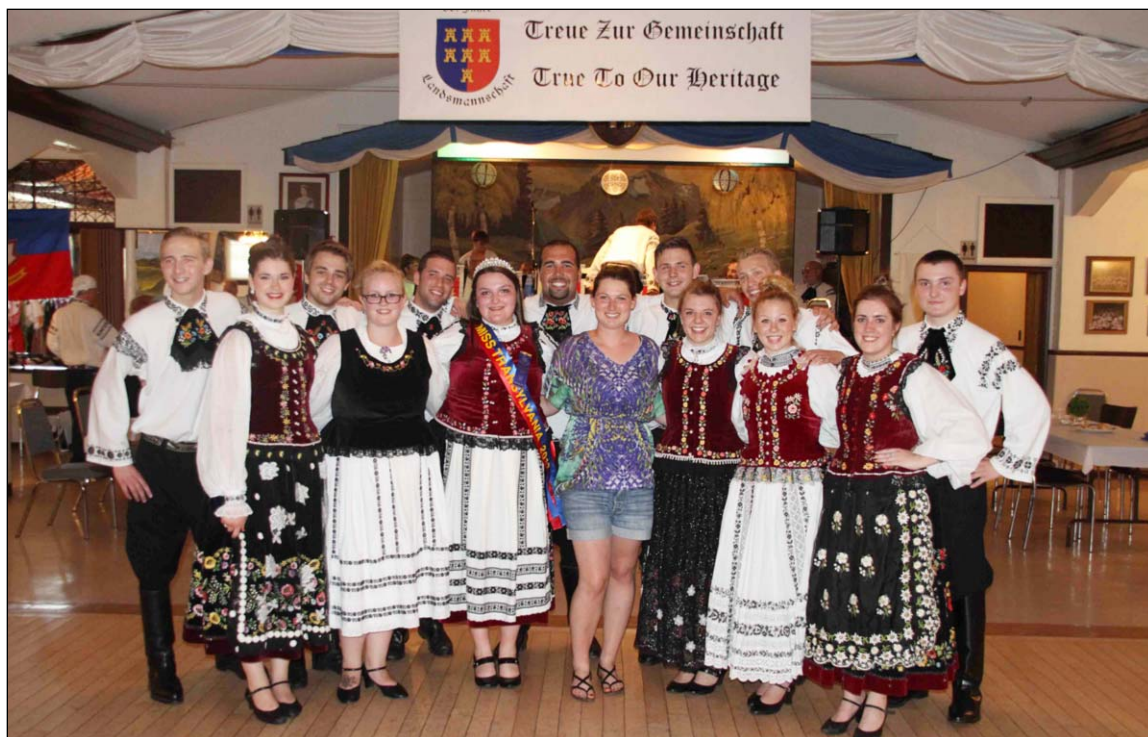
Transylvania Club Youth Dance Group - Heimattag 2013

Our Office Hours: Wednesday to Friday – 0900 to 1300