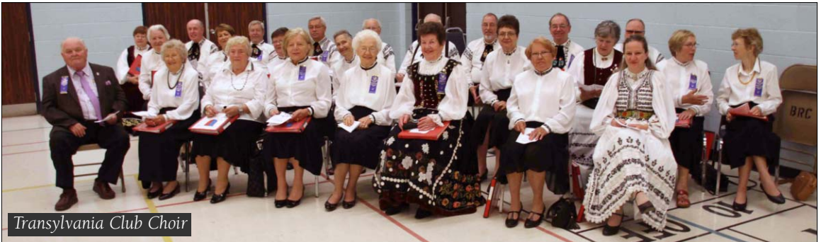
Transylvania Club Choir