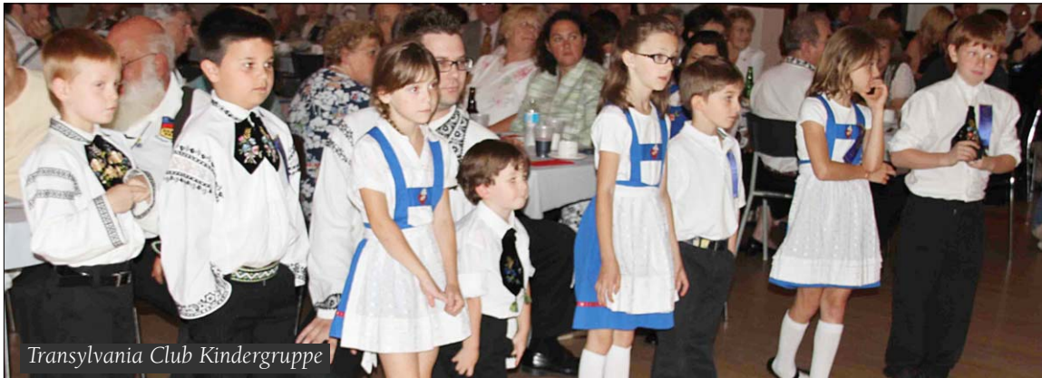
Transylvania Club Kindergruppe