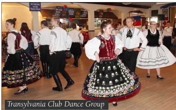
Transylvania Club Dance Group