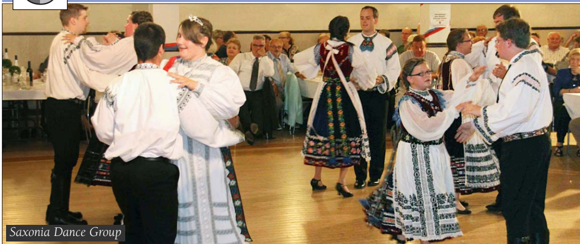
Saxonia Dance Group