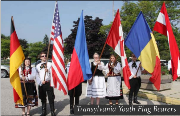
Transylvania Youth Flag Bearers