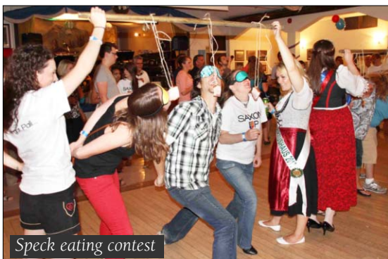
Speck eating contest