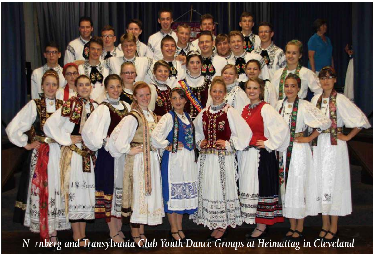
N rnrberg and Transylvania Club Youth Dance Groups at Heimattag in Cleveland

Our Office Hours: Tuesday to Friday - 09:00 to 13:00