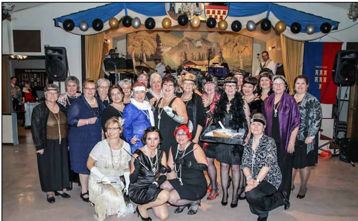
The Ladies' Auxiliary presents the Roaring 20s

Our Office Hours: Tuesday to Thursday - 09:00 to 13:00