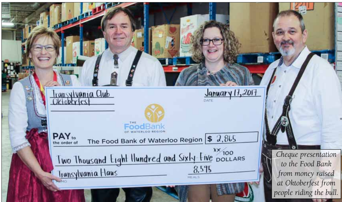
Cheque presentation to the Food Bank from money raised at Oktoberfest from people riding the bull.