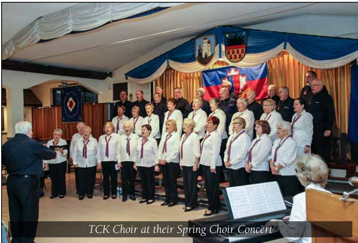
TCK Choir at their Spring Choir Concert

Our Office Hours: Tuesday to Thursday - 09:00 to 13:00