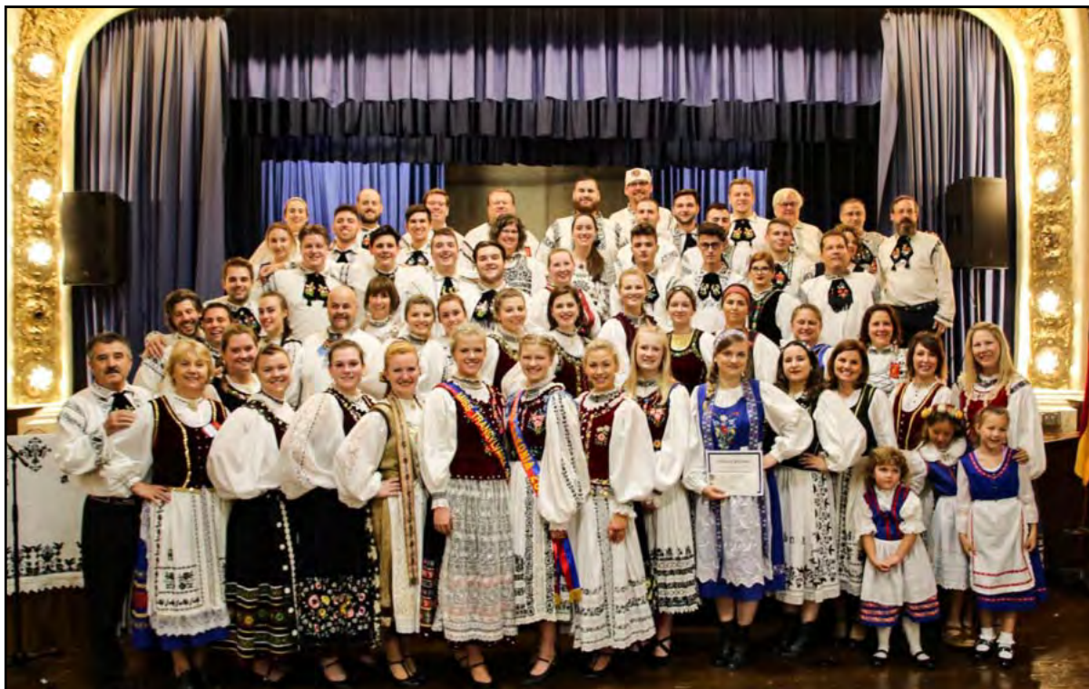
Dance Groups at Heimattag 2018 – Cleveland, OH

Our Office Hours: Tuesday to Thursday - 09:00 to 13:00