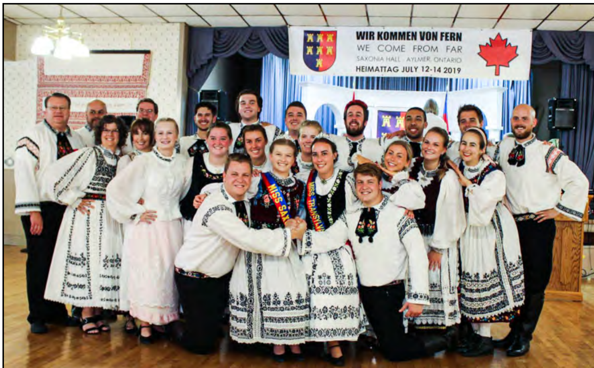
Transylvania & Saxonia Club Dance Groups - Heimattag 2019 – Aylmer

Our Office Hours: Tuesday to Thursday - 09:00 to 13:00