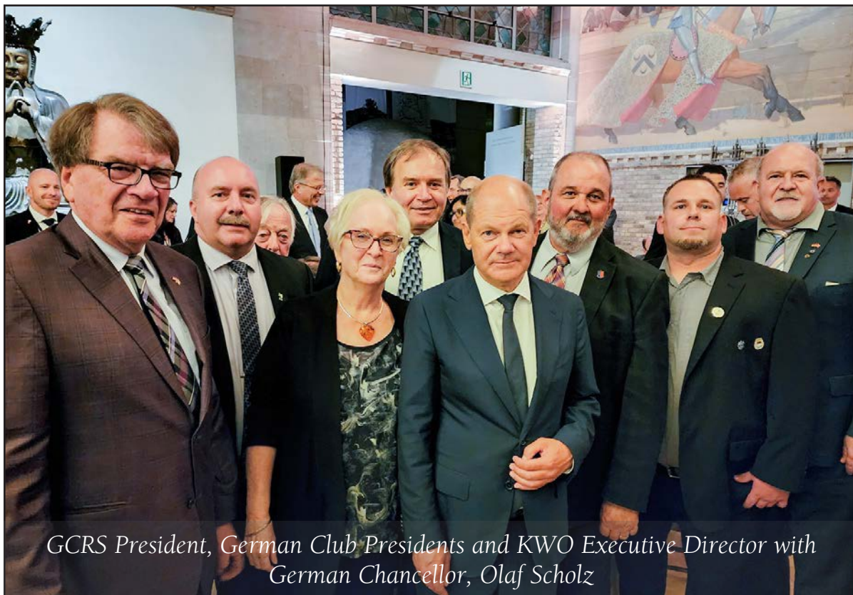
GCRS President, German Club Presidents and KWO Executive Director with German Chancellor, Olaf Scholz