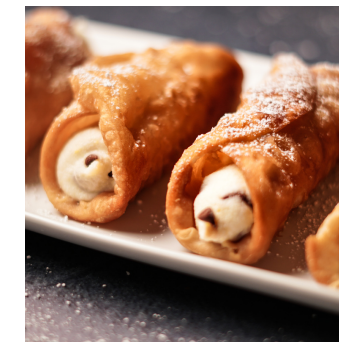
Eat a Lobster Roll or Cannoli