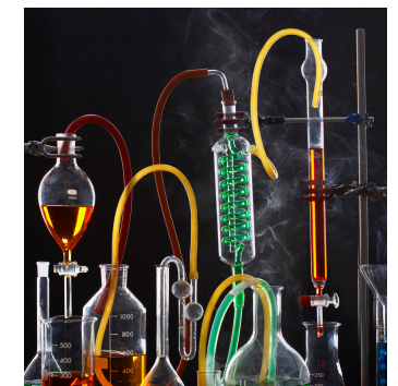
Museum of Science