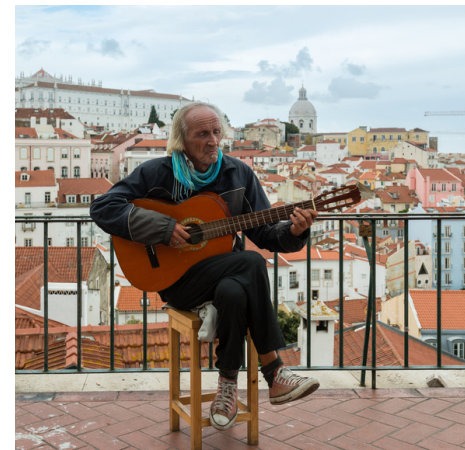
Live Fado Music