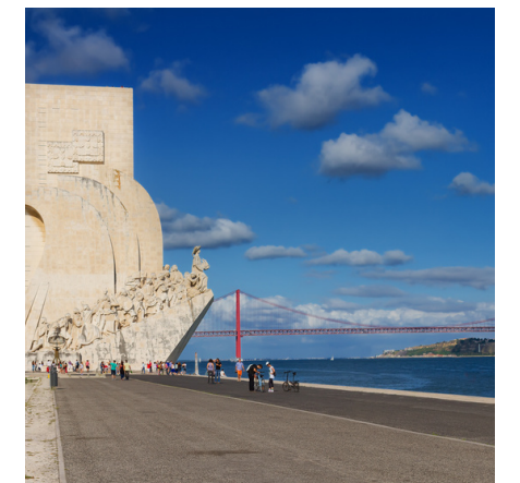
Tagus River Cruise