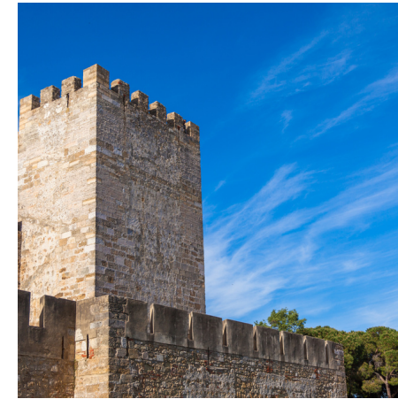
São Jorge Castle