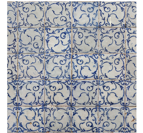
National Tile Museum