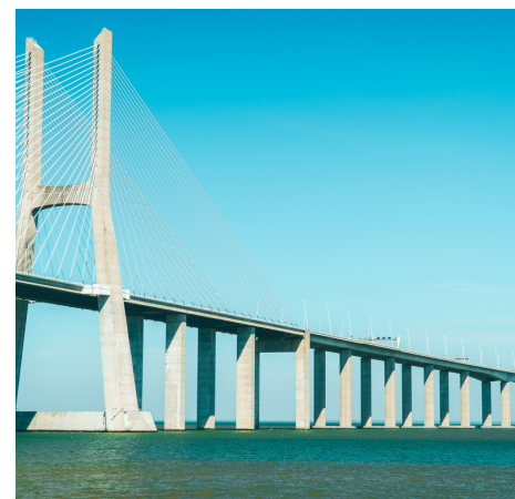
Pilar7 Bridge Experience