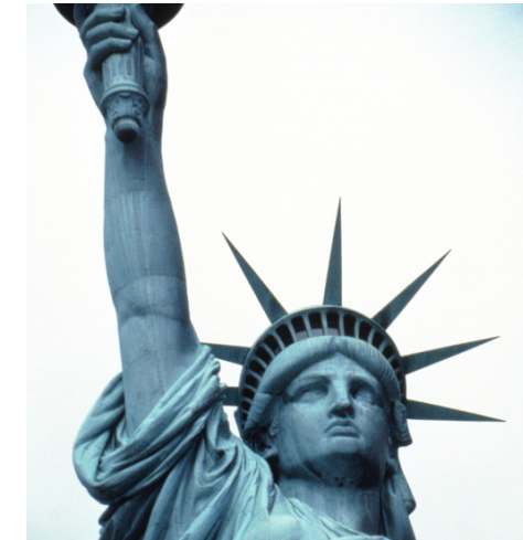
Statue of Liberty