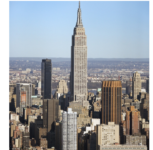
Empire State Building