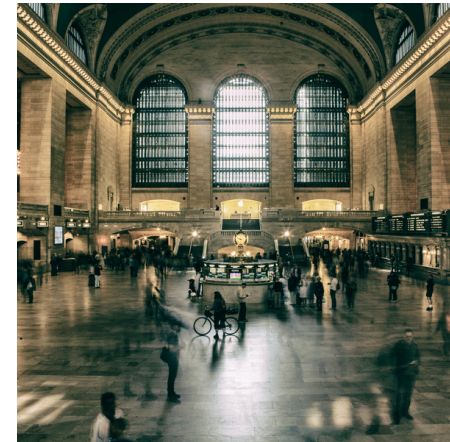
Grand Central Station