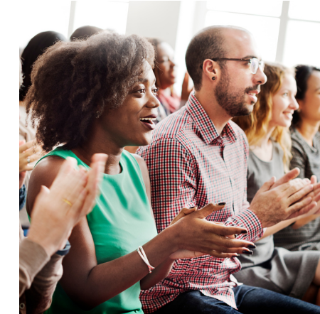
Attend a TV Show