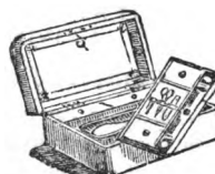
Ladies' Dressing Cases, from 14s. 6d.