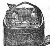
Ladies' Travelling Bags.

Card Cases, in pearl, silver, and inlaid. Album, Scrap, and Manuscript Books, Where Is Its. Inkstands, in bronze, ebony, walnut, oak, and buhl. Travelling Writing Cases for India. Envelope and Stationery Cases. Glove Boxes, Reticules, and Carriage Bags. Penknives and Scissors. Cases of Choice Cutlery. Ladies Compa- nions, 7s. 6d. Card Baskets. Work Boxes. Carved Ivory and Pearl Paper Knives. Book Stands, Slides, and Letter Boxes. Key Boxes and Jewel Cases. Port Monnaies, Tablets, and Satin Card Cases Cases of Scent Bottles. Bagatelle Boards, all sizes.